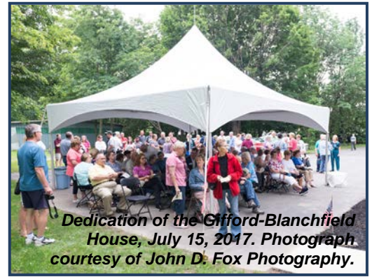
Dedication of the Gifford-Blanchfield House, July 15, 2017.

Office Hours: Tuesday, Wednesday & Saturday 10 am – 2 pm, Thursday 4 – 7 pm