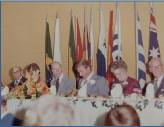
Head table with distinguished guest and the Weitz family.